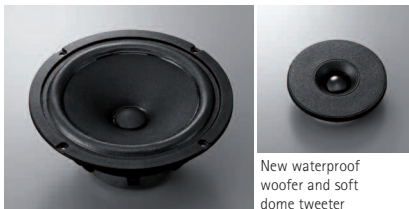
New waterproof woofer and soft dome tweeter

Yamaha drew on its long experience as a manufacturer of top quality HiFi speaker systems to develop these three all-weather models. We were able to make them extremely durable while still maintaining audio performance up to Yamaha standards. The woofer uses a highly responsive cone and a fluid-cooled soft dome tweeter, both specially processed for water resistance. The internal structure has been carefully designed for optimal time alignment between the two units, providing proper sound imaging. A waveguide and front baffle ensure good sound dispersion characteristics. Tonal clarity in all frequency ranges is excellent, with very low distortion.