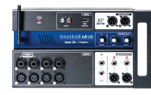
Soundcraft ui 12

Ui is safe, simple and secure, empowering you to be able to mix easily from anywhere in the venue and supercharge your live sound with powerful digital mix features and dedicated processing from some of the biggest names in the business - dbx®, Lexicon® and Digitech®.