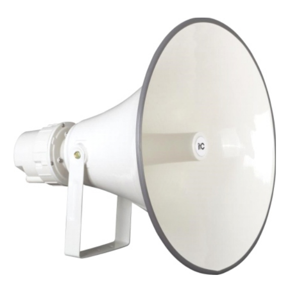
Material: plastic shell + iron mesh cover